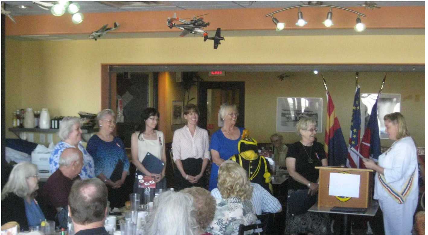
Installation of Picacho Peak Auxiliary No. 1 Officers