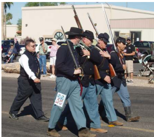
Marching with members of the 1 st New Mexico