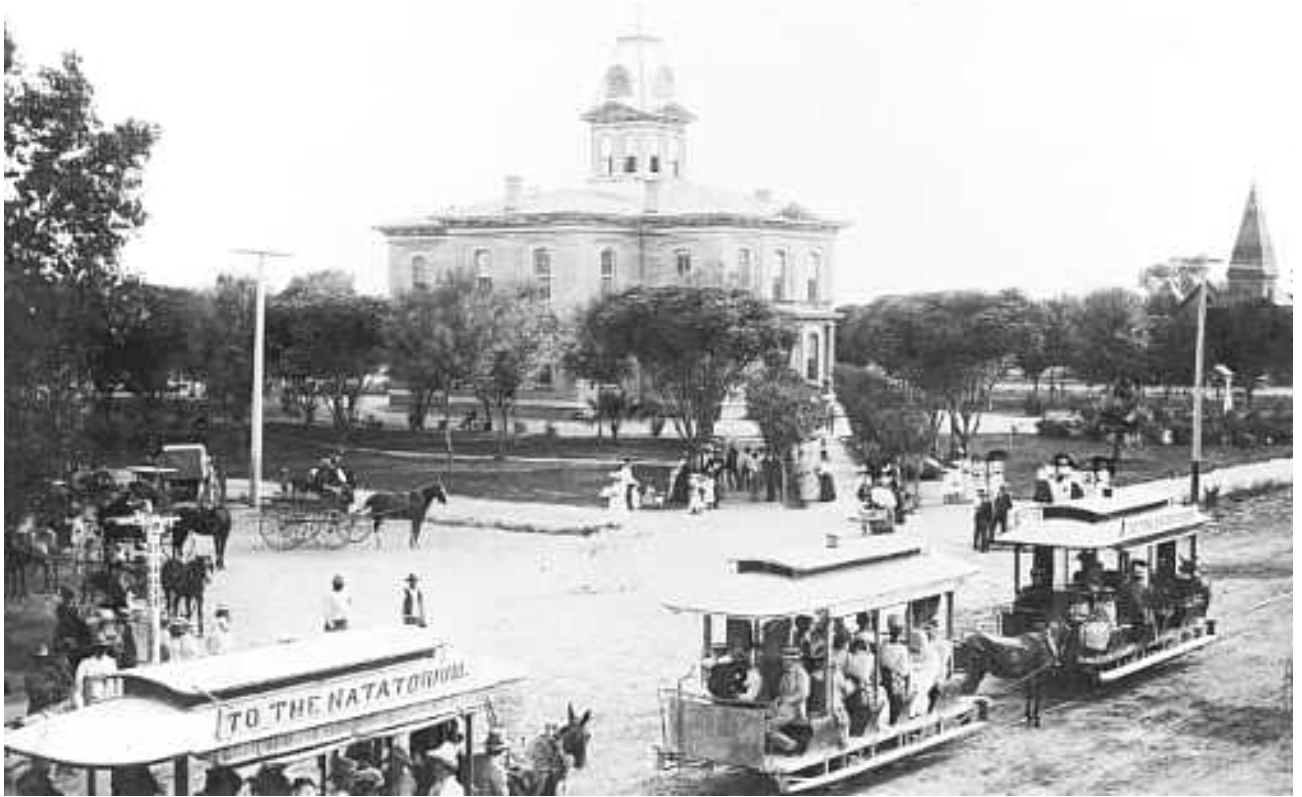
Horse drawn streetcars pass the old courthouse in Phoenix late 1890's