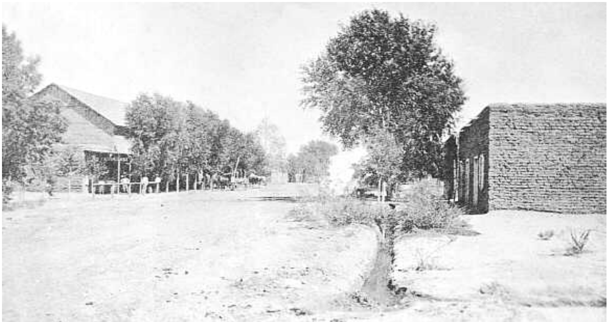
Washington Street in Phoenix, 1870's