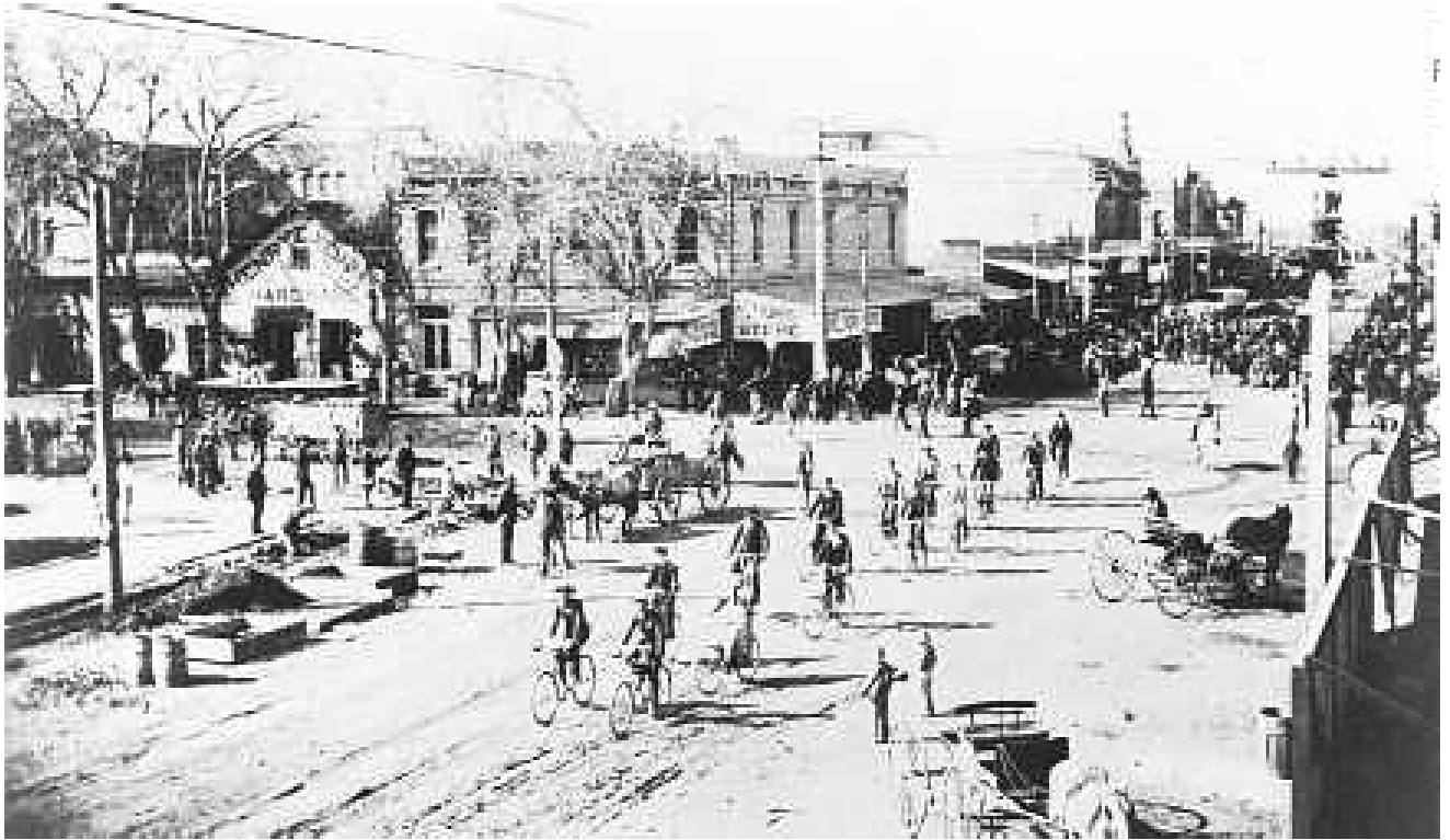
Cyclists at 1 st Street and Washington in Phoenix, late 1880's