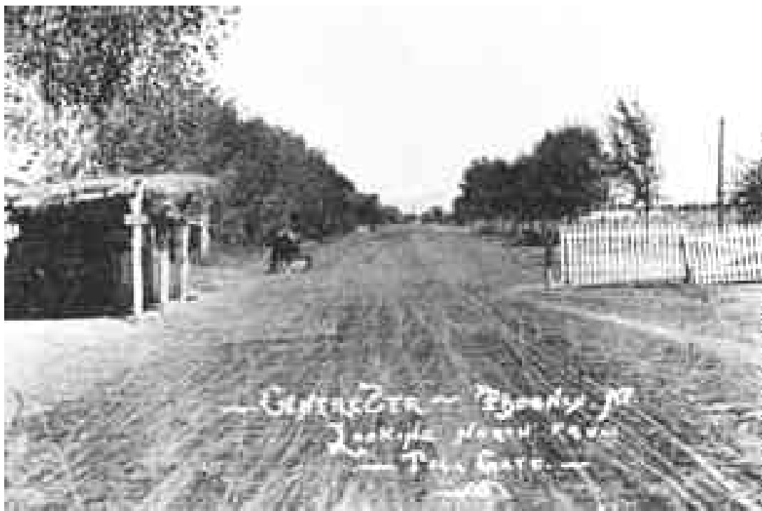
The Central Avenue Improvement Association, a subsidiary of the Arizona Water Co, owned the tollgate at Central and McDowell avenues in the 1880s. The toll for wagons and buggies was 25 cents. Bicycles were free, and the town was full of bicycles.