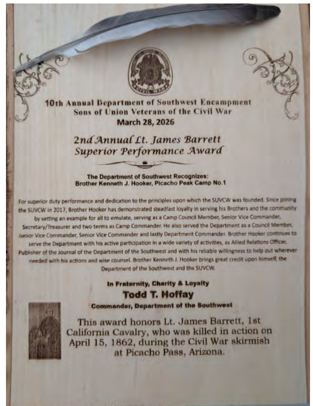
Lt. James Barrett Award for Superior Performance