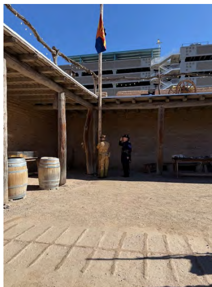
Flag raising at old Ft Lowell