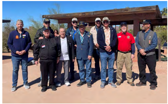
First known PPC1 Camp Meeting held outdoors! Brothers, Sister, and guests enjoyed the sunshine at Papago Park, Phoenix, AZ and had a nice BBQ afterwards.

Meeting updates: Meeting was held on May 16, 2026. Meeting minutes to be published in the next Newsletter. Next meeting will be on July 18, 2026 11:30 a.m. at the Mustang Library (Reading room), 10101 N. 90th Street, Scottsdale, AZ.