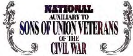
Picacho Peak Auxiliary No.1