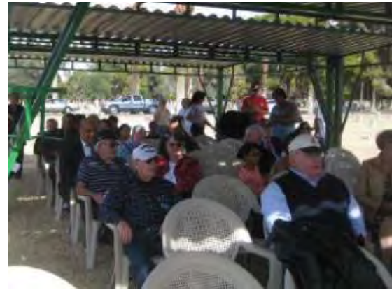
Camp Brothers in attendance