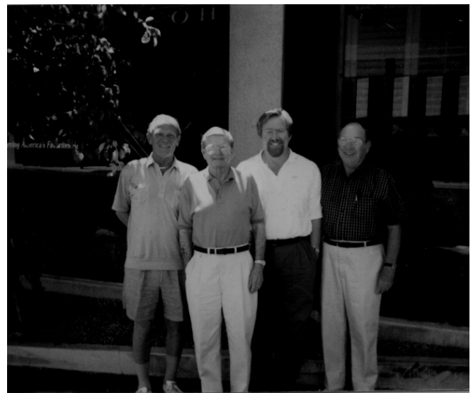
First Camp Officers 1996-1997