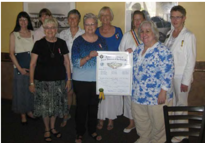
Sisters present at ceremony: