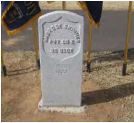
Headstone and grave of Private Ambrose Skinner