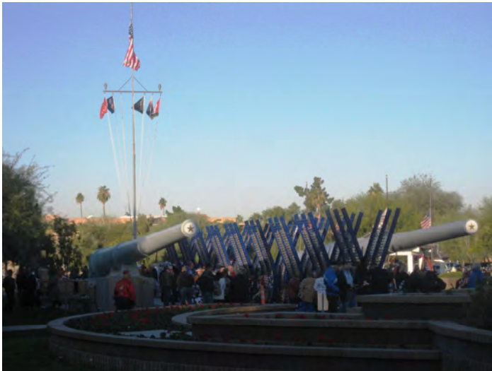
Names of Arizona WWII veterans who died in the war are between the USS Arizona gun barrel (on left) and the USS Missouri