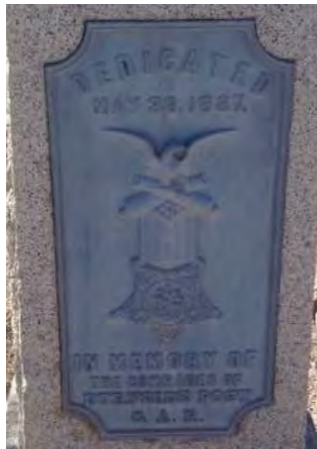
“DEDICATED MAY 30, 1887 IN MEMORY OF THE COMRADES OF THE BURNSIDE POST G.A.R.”