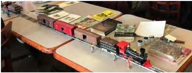
The “Texas” far upper left and the “General”