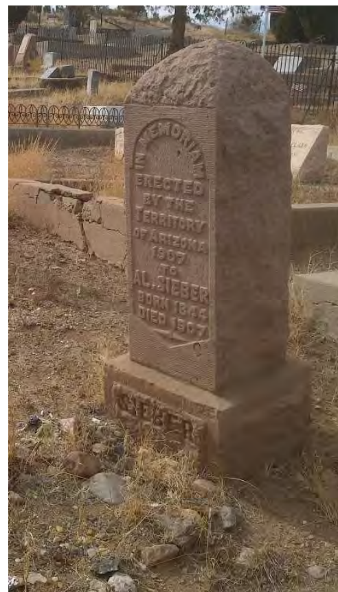
Al Sieber's grave