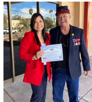
Bank of America