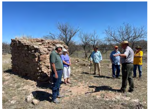
Participants at ruins of Camp Moore and Ft. Mason