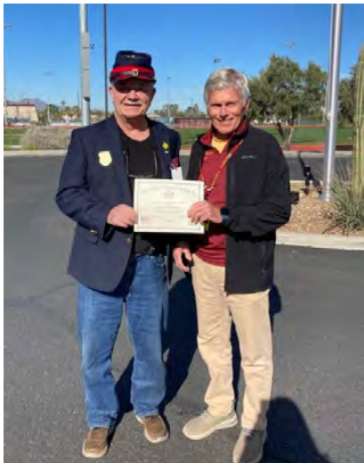
Salpointe Catholic High School