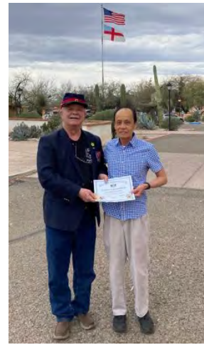
St Thomas Episcopal Church