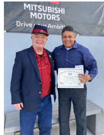
Quebedeaux Mitsubishi Motors