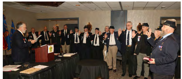
Officers of the Department of the SW- 2025