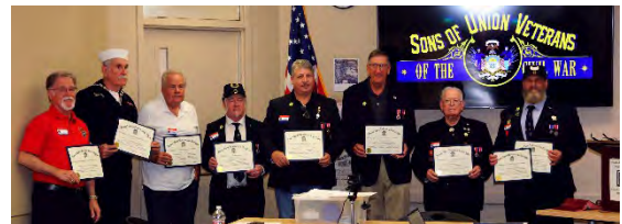
Congrats to all Camp Brothers who received awards!