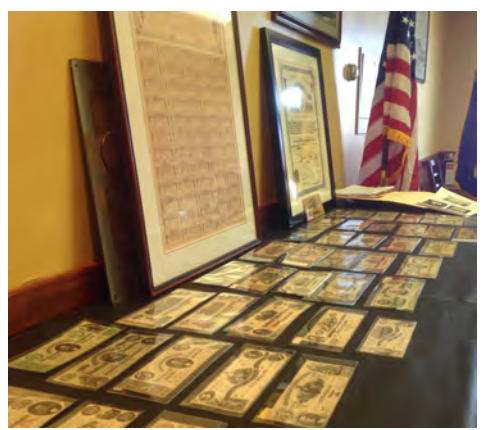
Display of Confederate currency and bonds