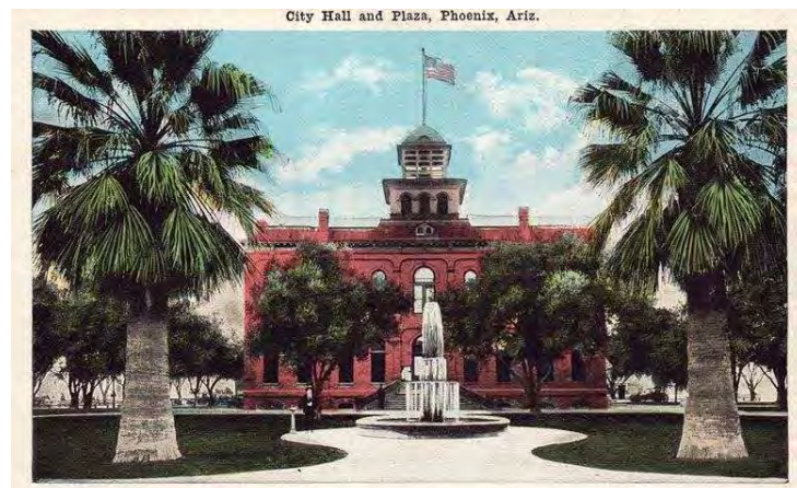
Phoenix City Hall Plaza (replaced by the Fox Theater in Phoenix, and today it is now a parking lot)

What the monument really looked like or what happened to it is unknown. It seemed odd to me that that monument was able to be placed and then taken so fast, so I assume maybe it was possibly wood? We may never know, but yes Phoenix did have a Union Monument for about 28 days, until the plaza started to come out of use, and was eventually demolished in 1931.