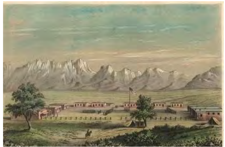
Fort Fillmore & the Organ Mountains

By Carl Schuchard - Rio Grande Historical Collections, New Mexico State University Library [1], Public Domain, https://commons.wikimedia.org/w/index.php?curid=32891306