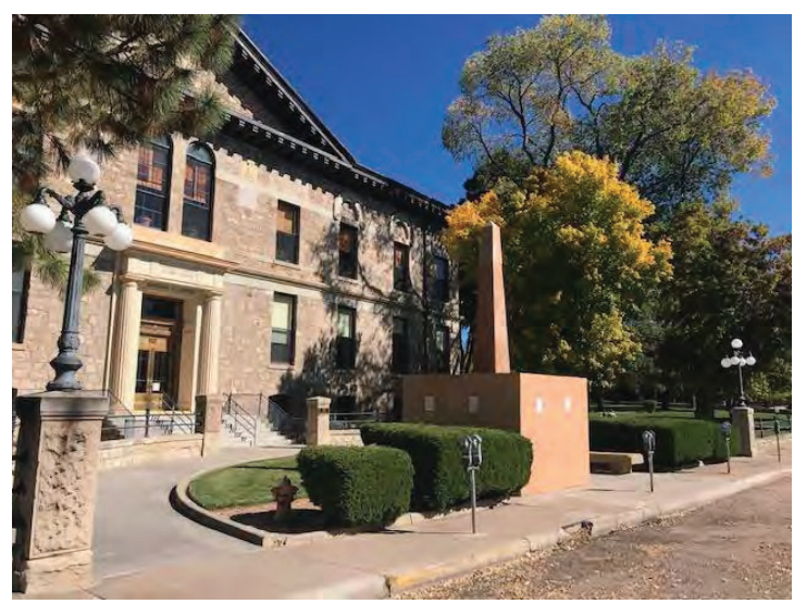
Carson Monument in 2021—boarded up to prevent grafiti/destruction