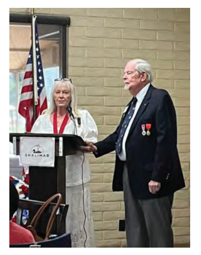
Congratulations to all of the Tent Sisters—here is to 20 more years!