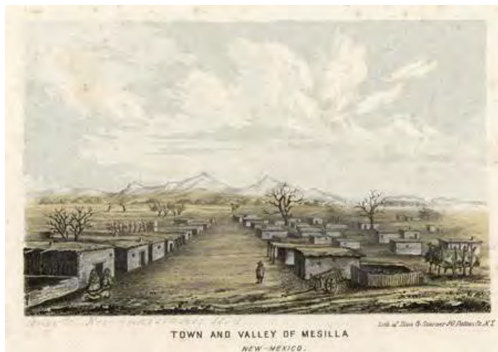
View of Mesilla in 1864