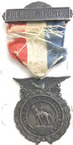
GAR badge from the 38th National Encampment

Our next meeting will be on November 20 th 2021, at the Manuel's Mexican Restaurant, 2820 E Indian School Rd, Phoenix, AZ