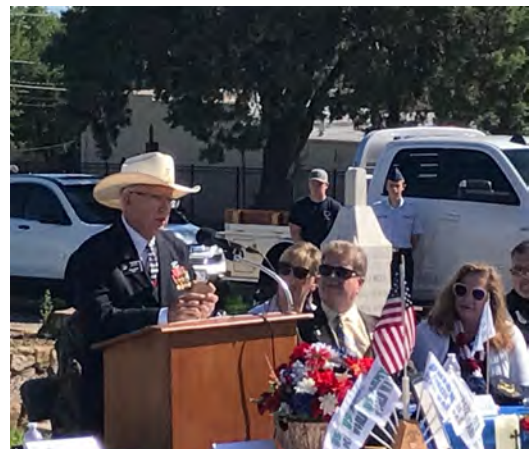
Prescott Mayor Phil Goode