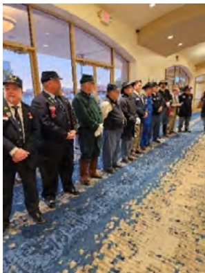
30 of our DSW Brothers served as escorts at the convention, including the DC, 6 PDCs, and all 3 current CCs!