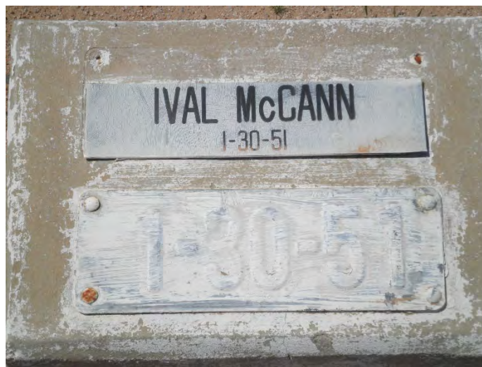
Ival McCann grave.