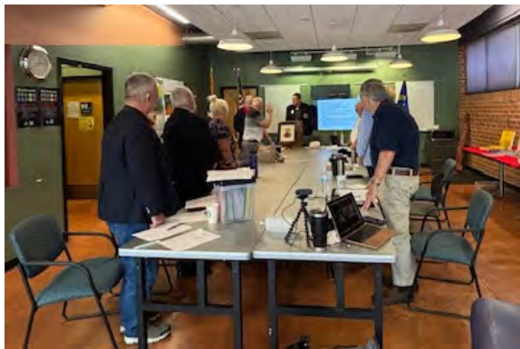
Meeting space: 1510 E. Grant Rd Ward 3 Council Offices, Tucson, AZ.

A synopsis of General Orders was distributed to all Brothers, on 7 October 2024.