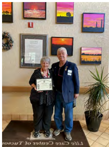
Life Care center of Tucson